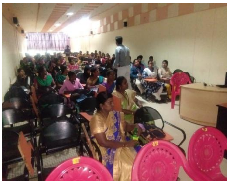
View of Participants