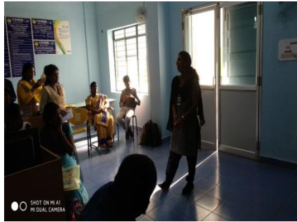
Feedback given by participant